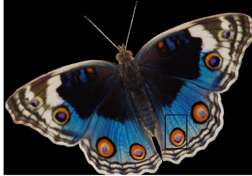
(b) Original Picture